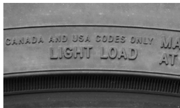
Figure 1 - Light Load molded into sidewall

Under the T.R.A.'s designation, tire load is divided into three categories: Light Load (LL), Standard Load (SL), and Extra Load (XL). Each refers to the tire's ability to carry a certain load at a given air pressure. Tires designed for LL, SL, XL duty are usually identified as such on the tire sidewall.